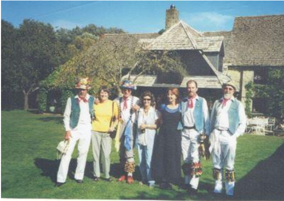
At Richard Branson's