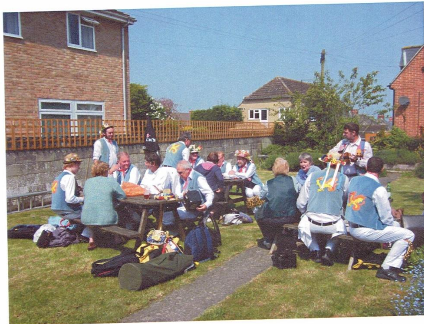
The beer break