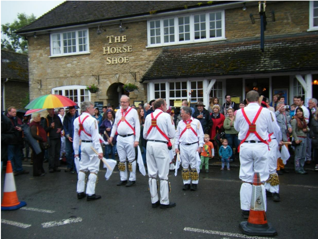
Bampton Whit Monday – SH's first visit for 150 years