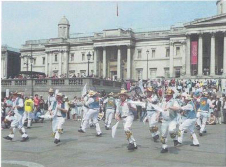
Our show dance in Trafalgar Square