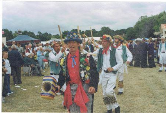
Uffington show with 2 Uffington lads leading!