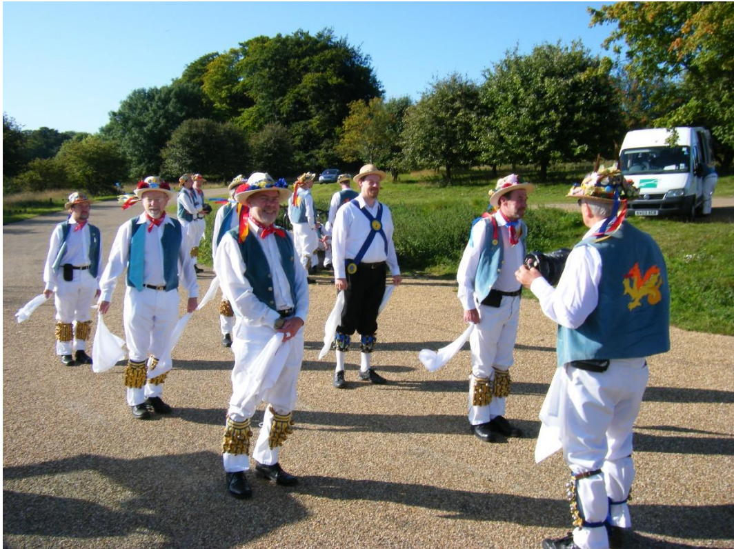
50 th Tour – Ivinghoe Beacon