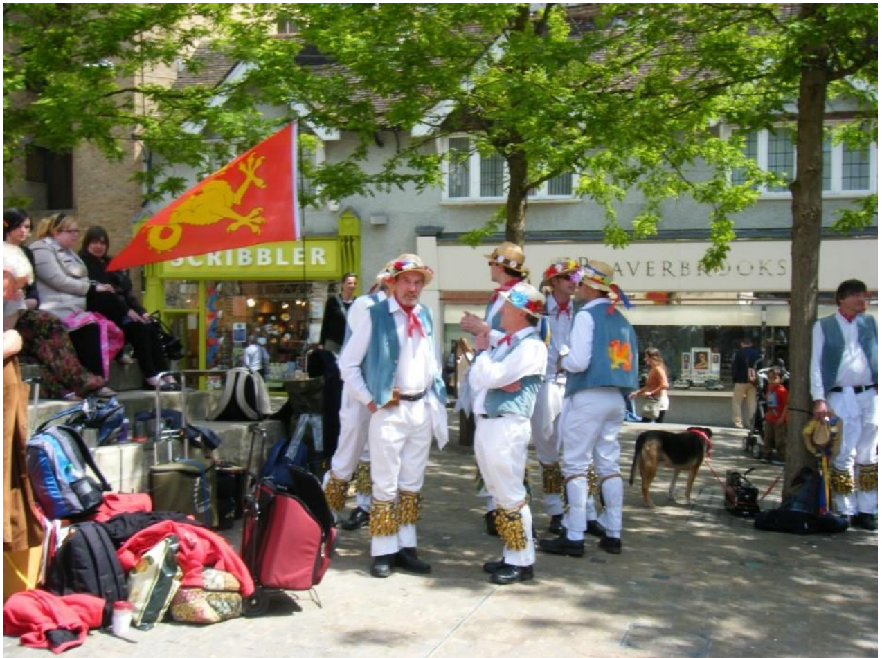
Masons Apron DoD