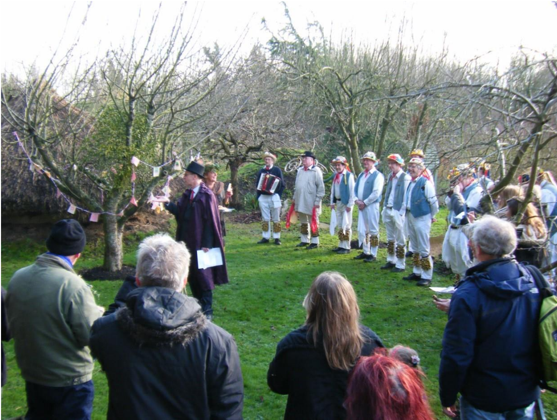
The first TWIGS