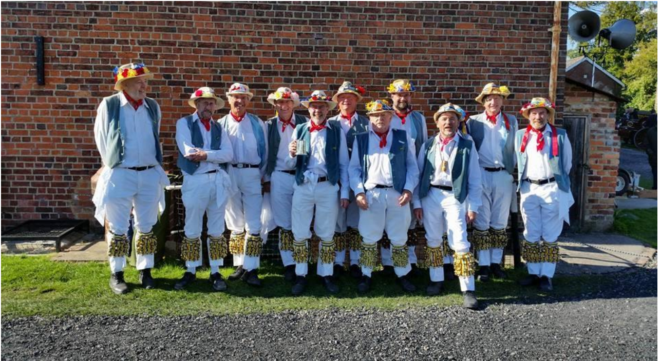
Compton beam engine