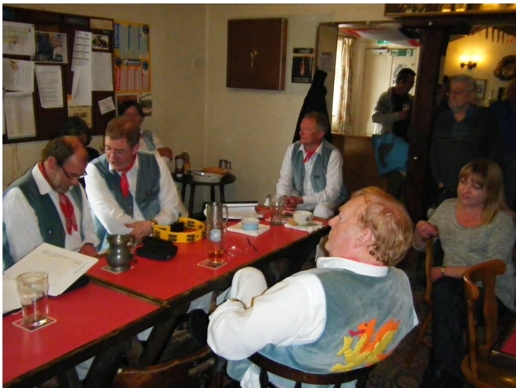
“Wake up that man” (May Lunch)