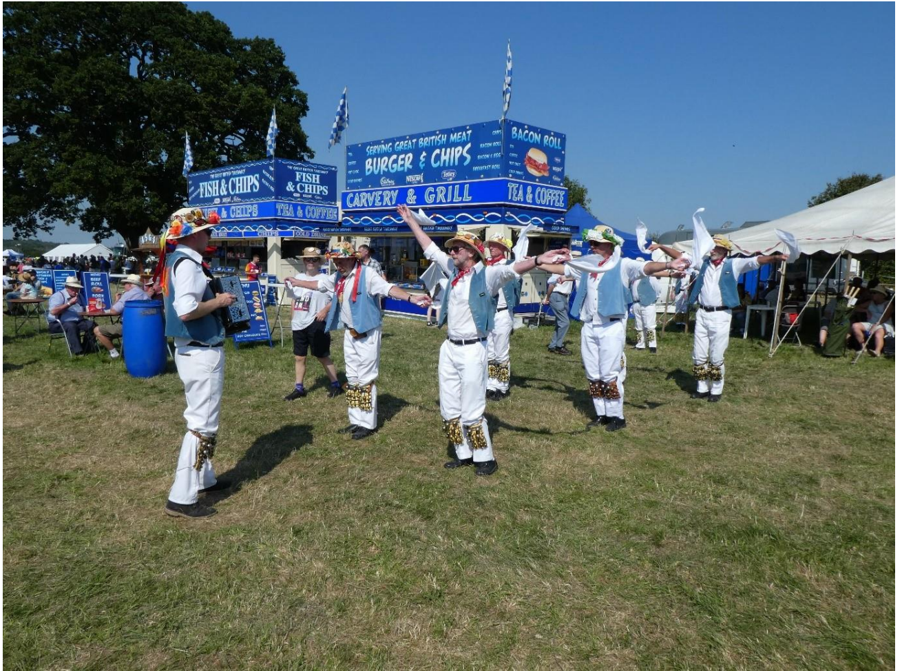
White Horse Show