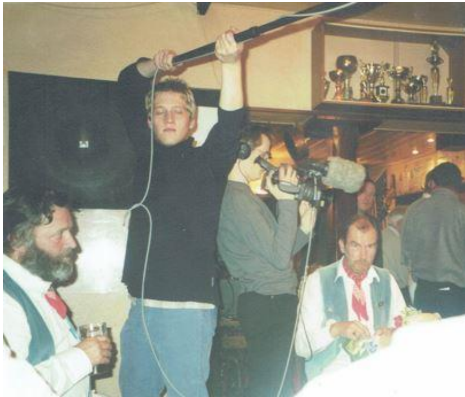
Filming for "House Swaps"