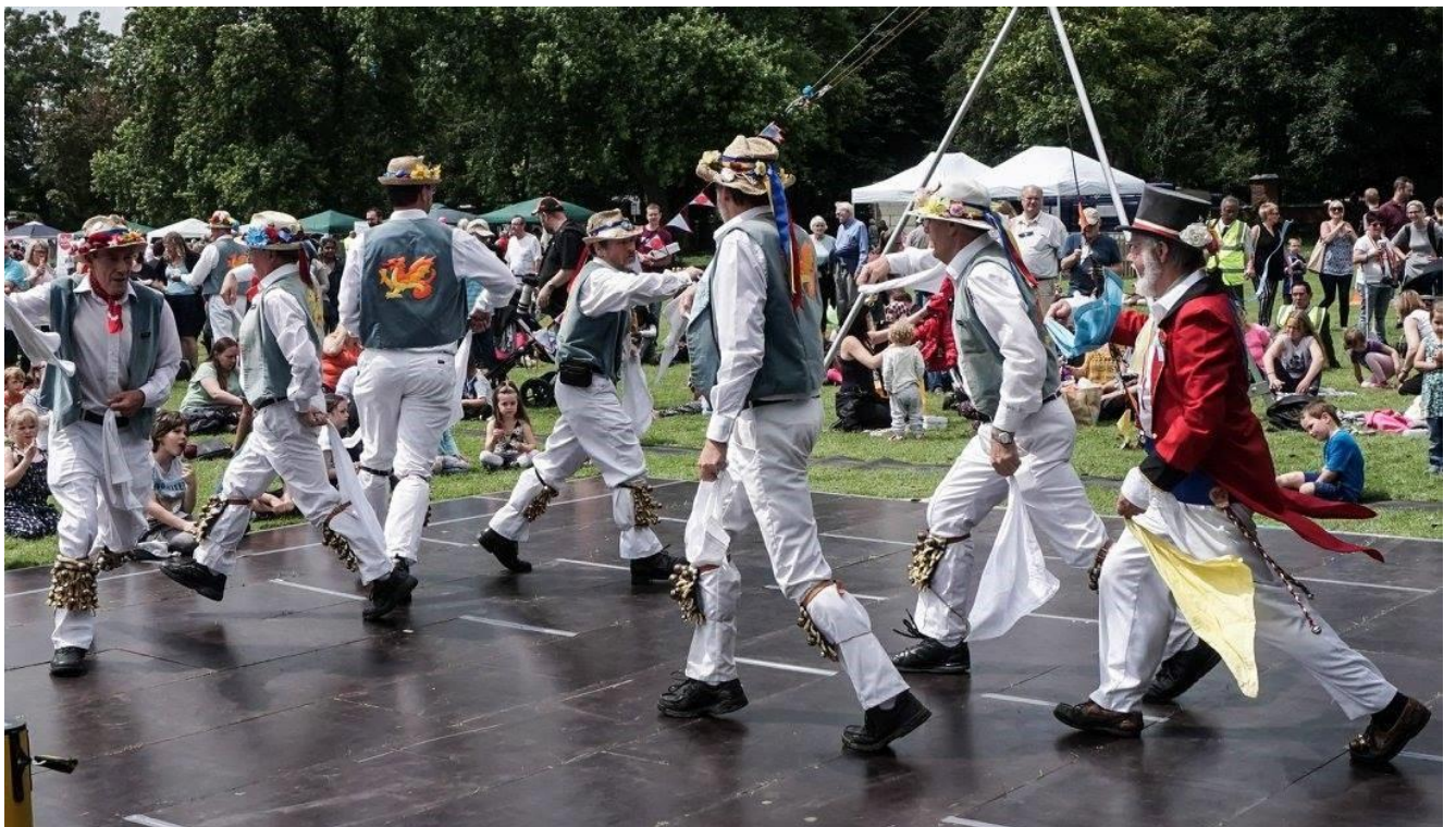
Childrens Dat - Swindon