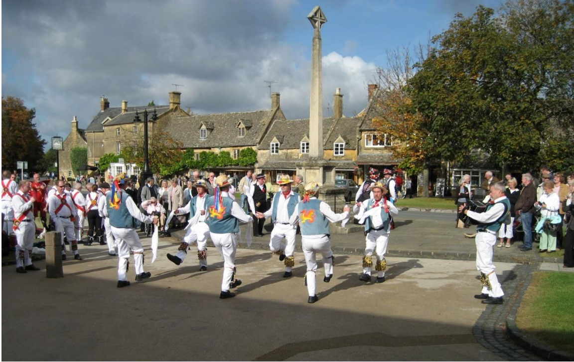
White Hart DoD