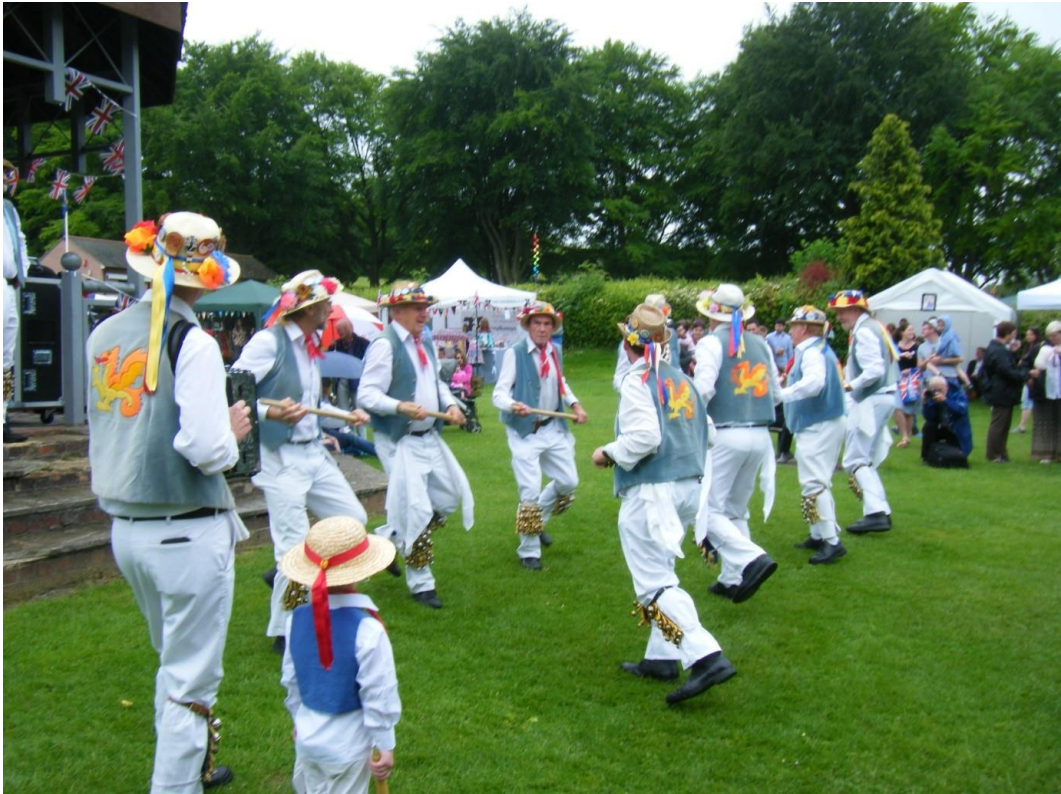
Queens 90 th – Wantage