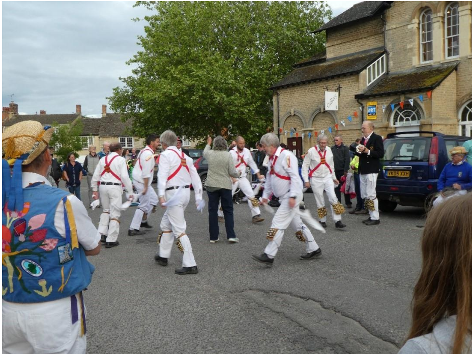
Bampton – Whit Monday