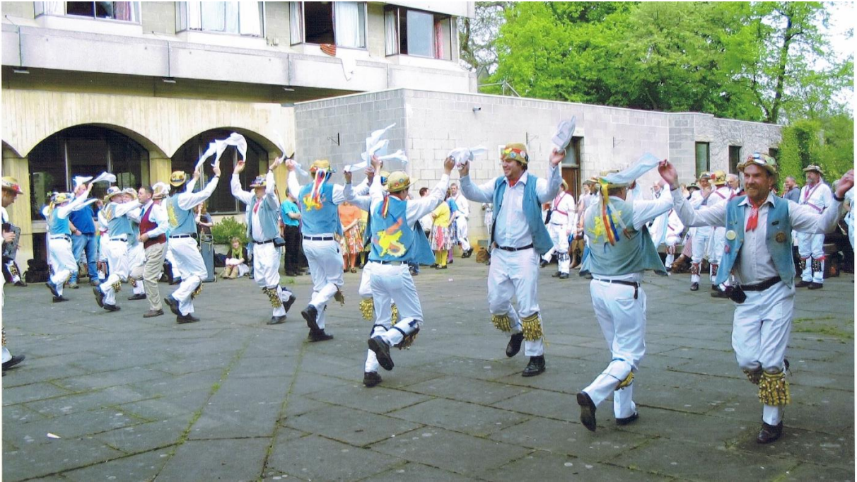
May Morn – Teddy's Roof