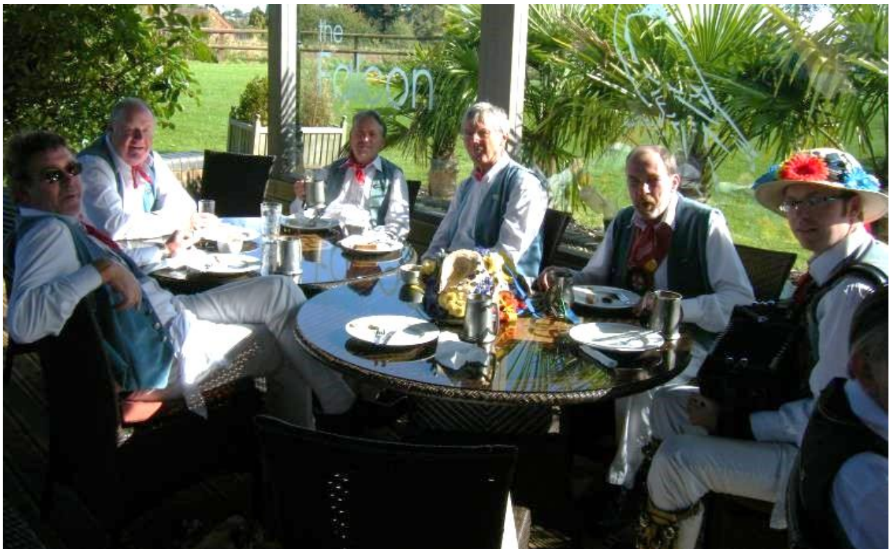
White Hart DoD