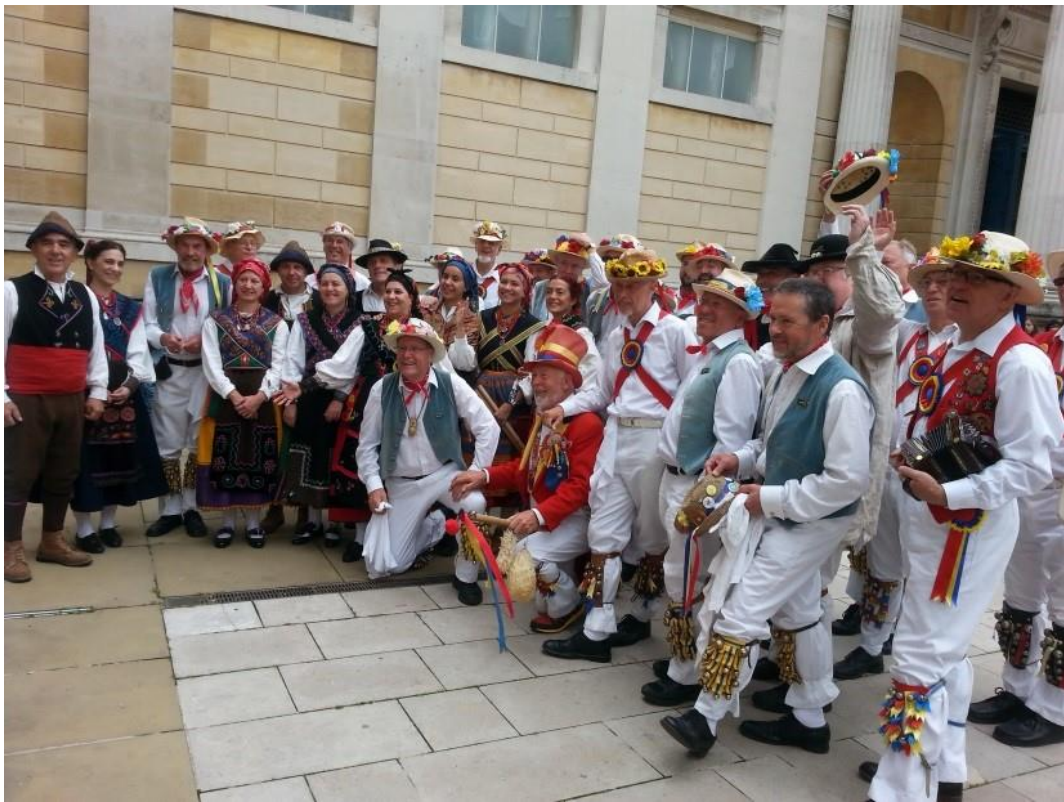
Spanish at the Ashmolean