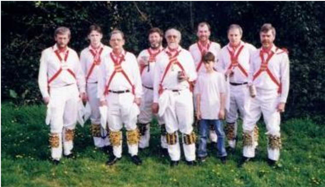
The SH Instructional Team