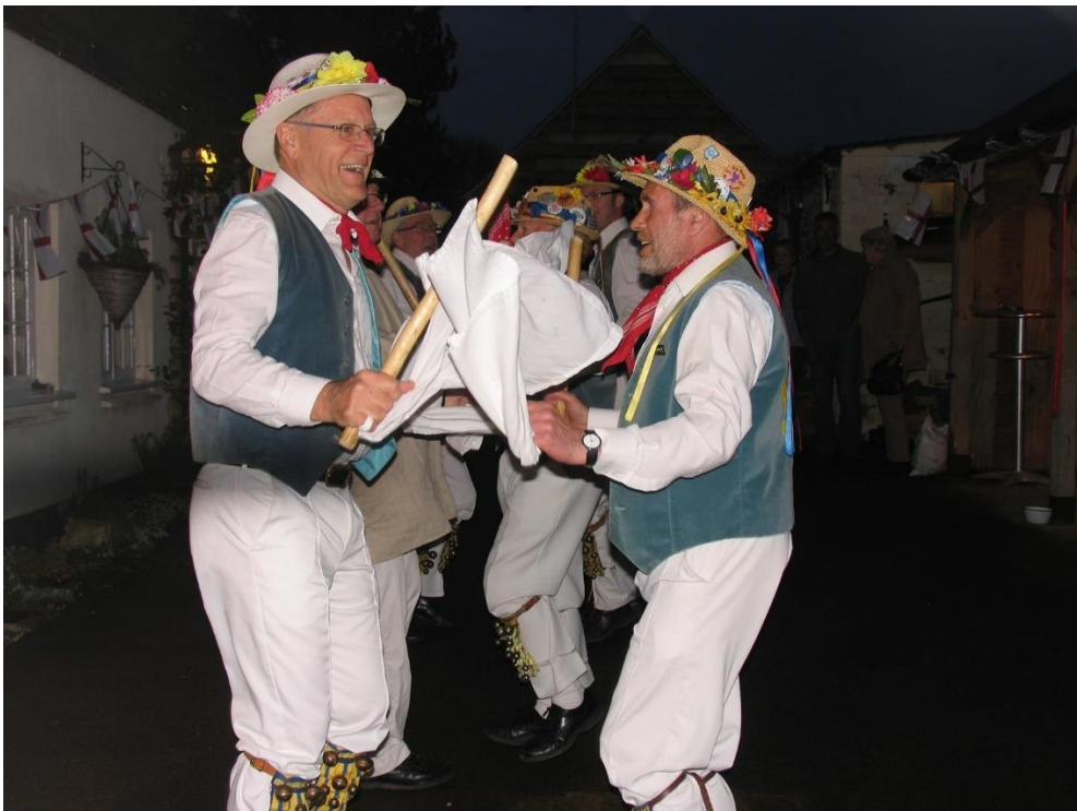
St George's day