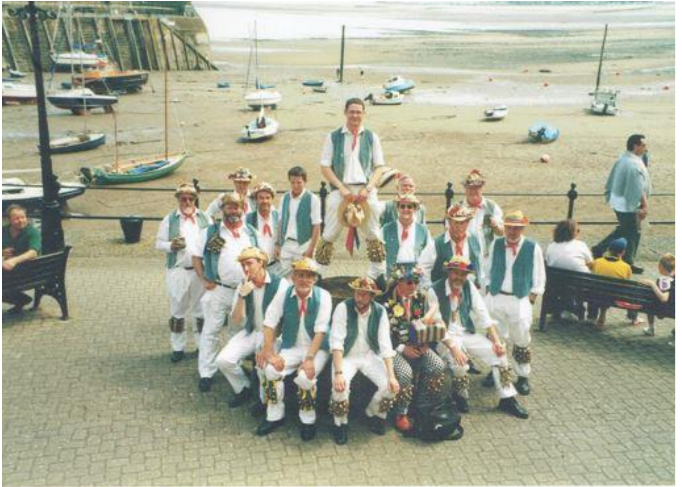
THE SOMERSET TOUR SIDE