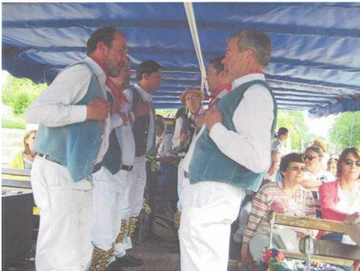
Windsor DoD – Beechams Pills on a boat