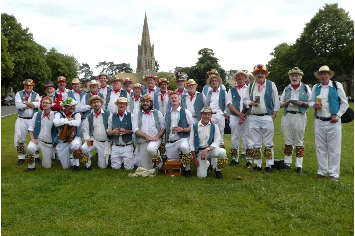
60 th year – Tour and DoD