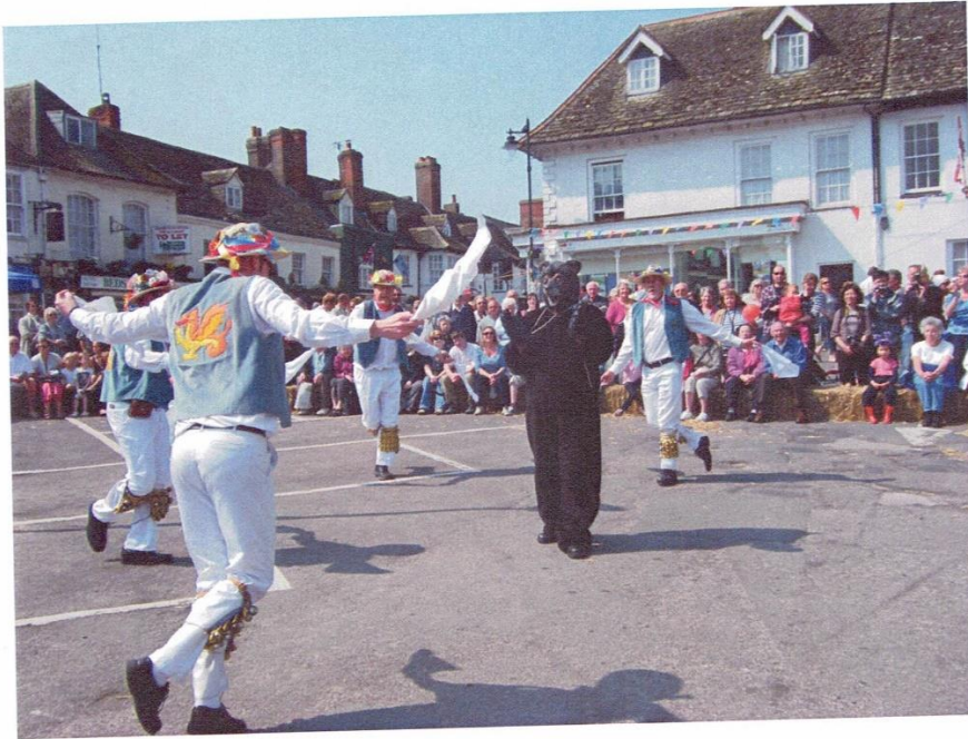
A dancing bear joins in Old Woman