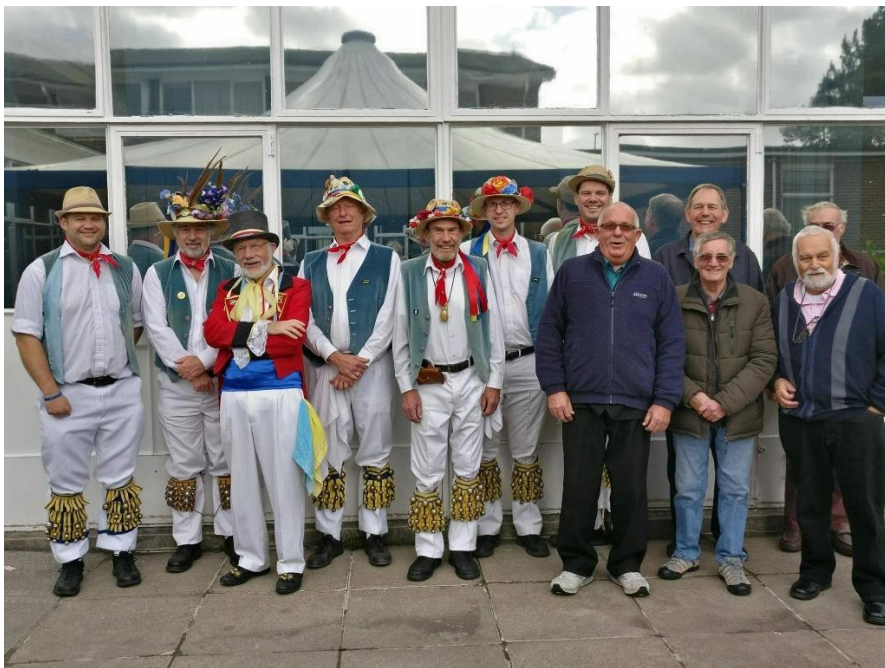
Icknield School closure