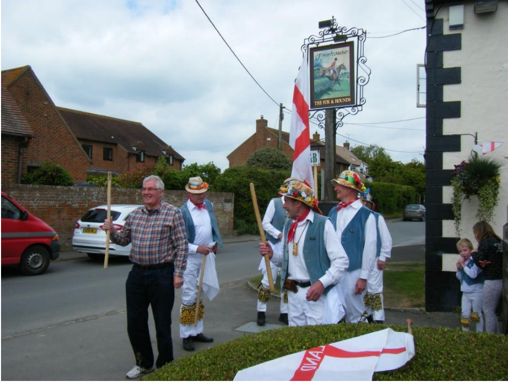
St Georges Day