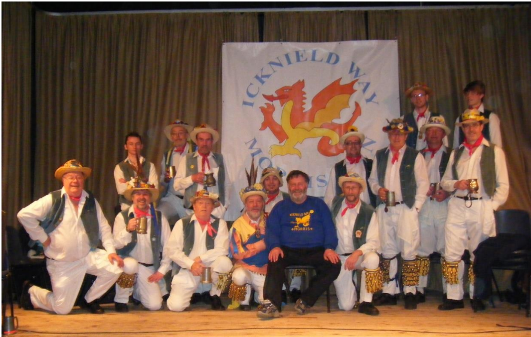
The 50 th Year Ale and DoD