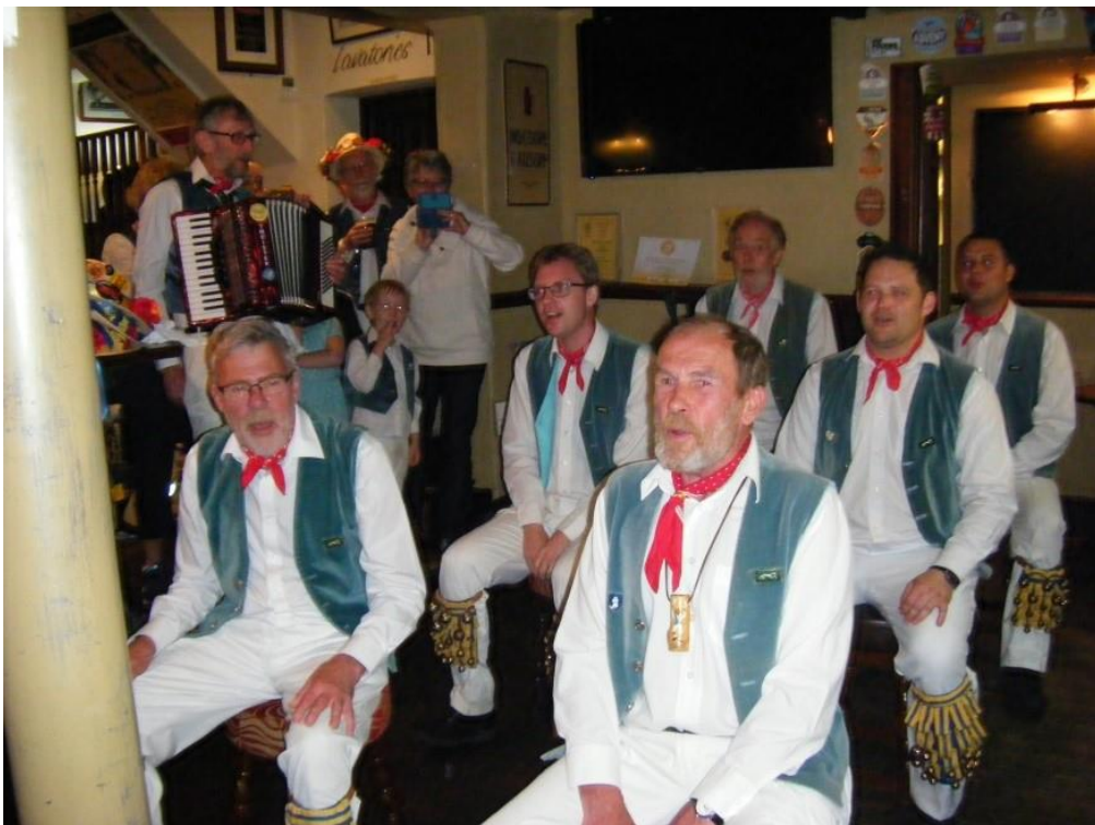
Chippenham – stool morris