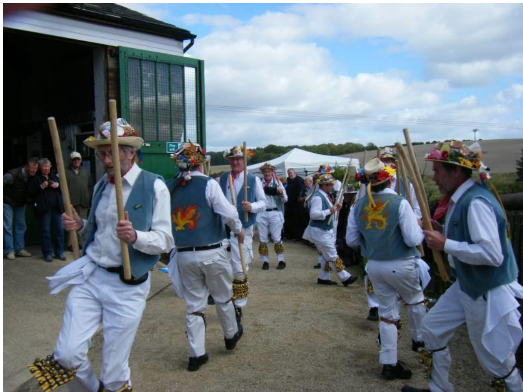
Crofton Beam Engine