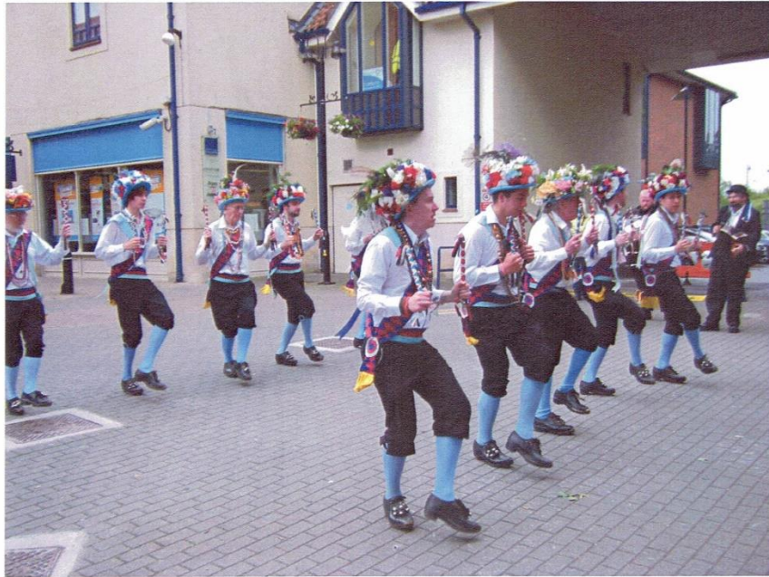
Down at the Bridgehouse we saw Earlsdon finish off their set before we did our stint with the neighbours – OSH.