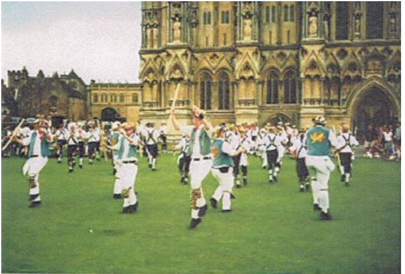
Mendip Ring Meeting: dancing outside Wells Cathedral