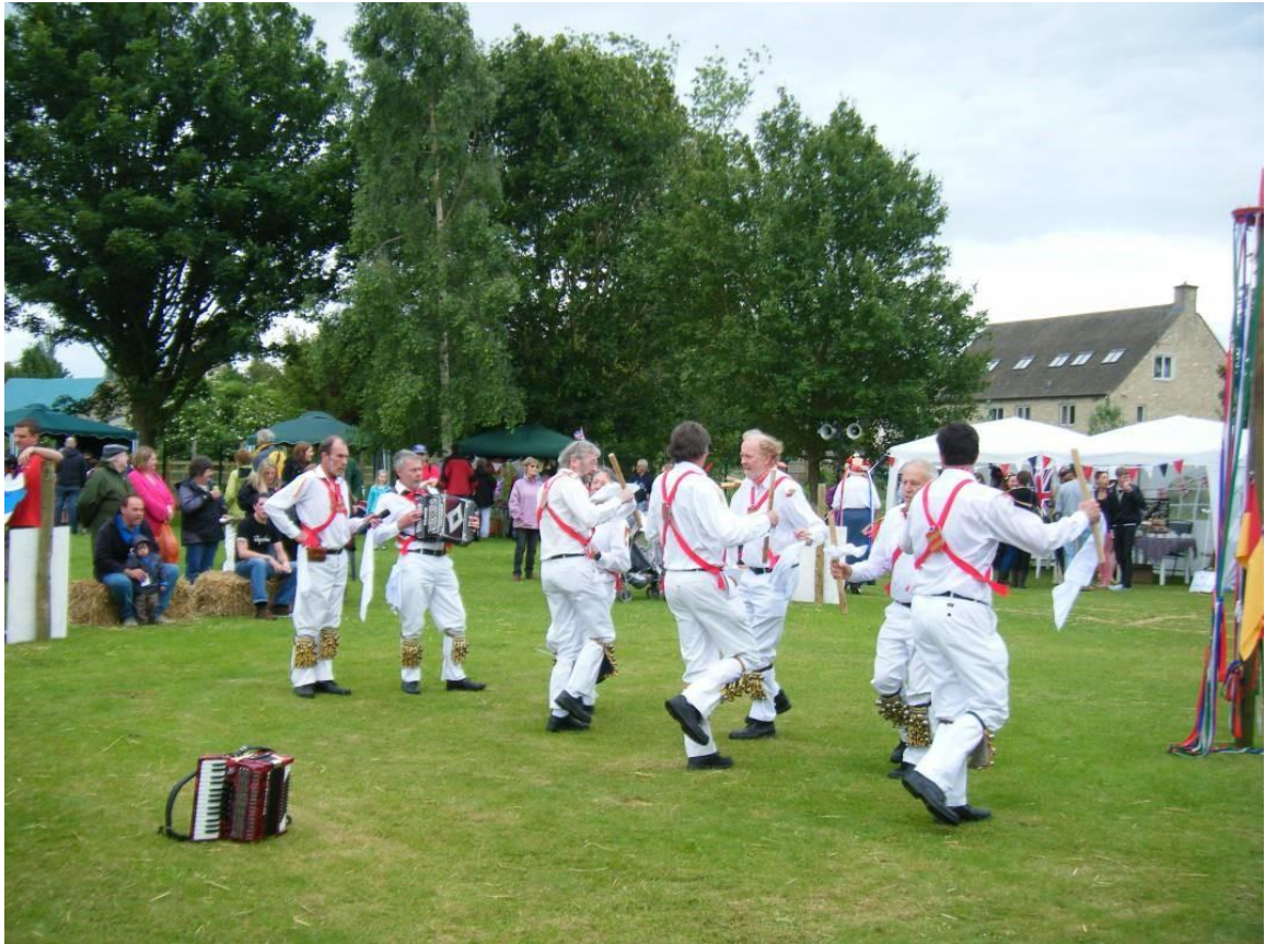
Stanton Harcourt – first fete