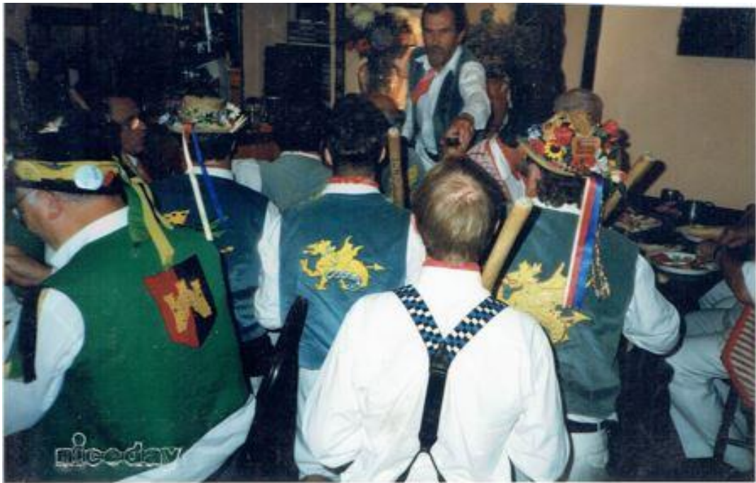
Seven Dwarves – Exeter Ring