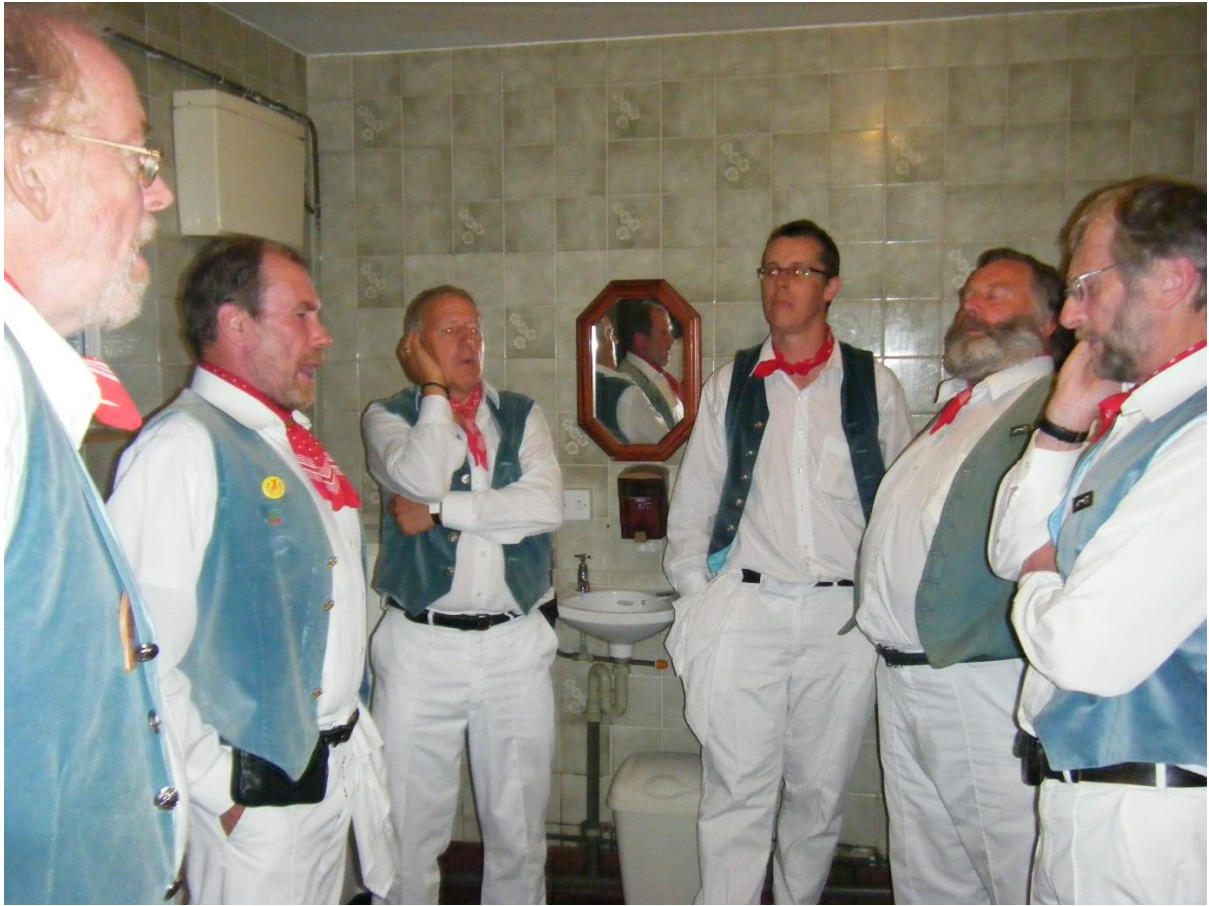
Singing in the Black Horse and the Abi Arms