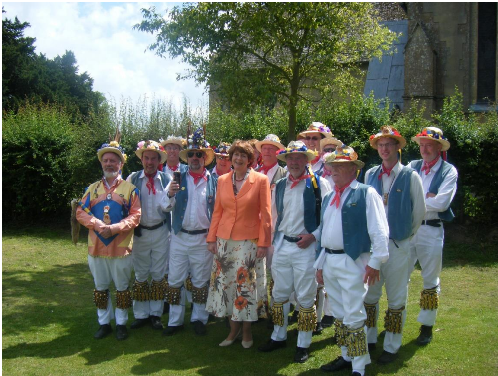
Uffington School Fete