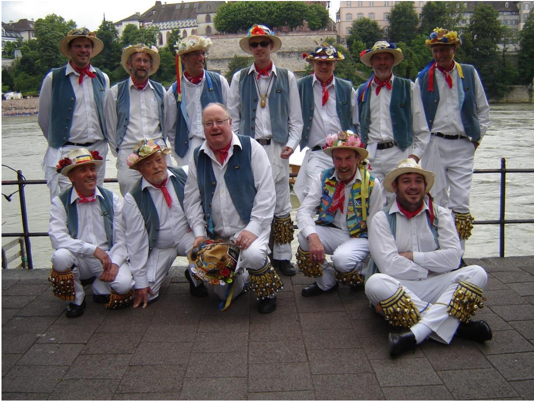
Three Countries Tour