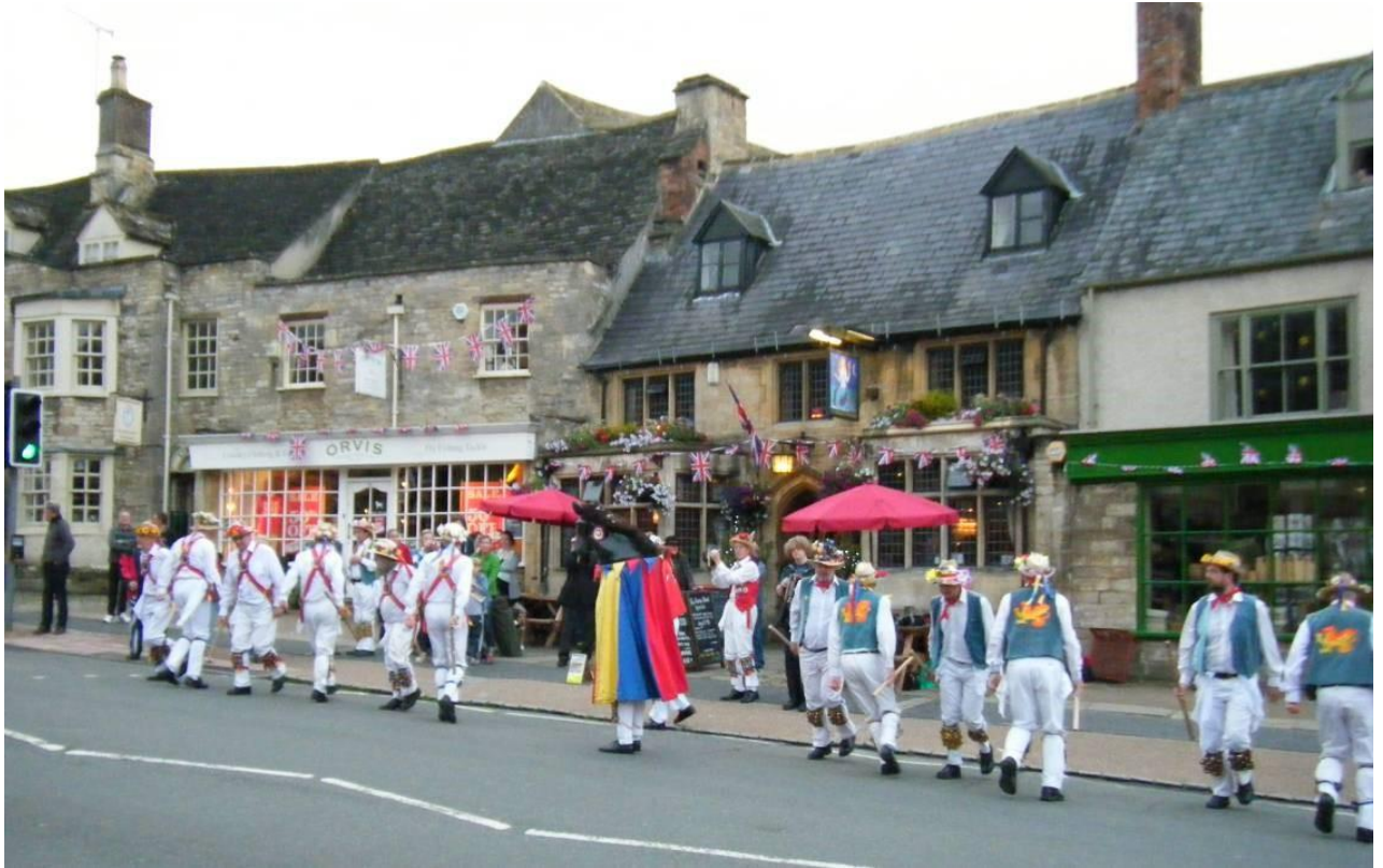
Burford with Glos MM