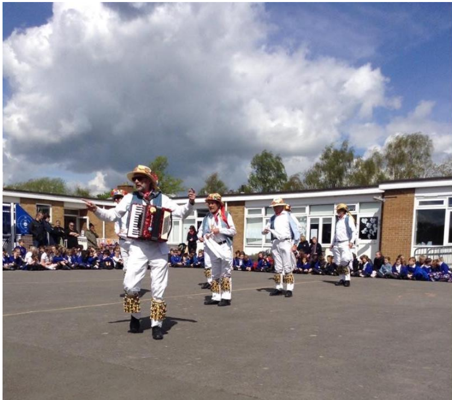
May Day – Charlton school